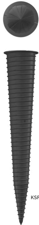
KSF K 60x800