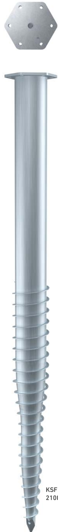
KSF M 140x 2100-M24