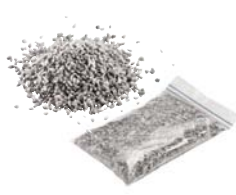
Special Granulate 500 g Item No. 21823