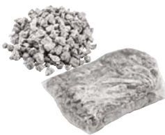
Special Granulate 1500 g Item No. 21824